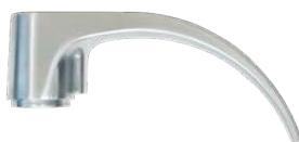
Net2 PaxLock Galaxy style handle