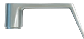
Net2 PaxLock Eclipse style handle